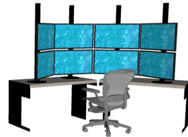
Figure 1. The large, high-resolution display used for this study, totaling nearly 33 megapixels, from [2].

Each analyst was given a two-hour session to solve this challenge. We chronicled their progress via video recording, think-aloud protocol, and an automated tool that captured a screenshot every minute. We followed the study with an interview where we asked a series of questions regarding their experience, as well as their typical workspaces and tools. All analysis was performed using a large, high-resolution display running Windows XP. The display consists of eight 30-inch LCD panels, tiled in a 4x2 configuration (Figure 1). We chose this workspace setup based on previous work where we learned the benefits of a larger display space [1]. The analysts were able to display all of the information relevant to the challenge without minimizing any windows. This meant that they could physically navigate to gain an overview of the dataset, examine details, switch tasks, and rapidly consult multiple views and tools.